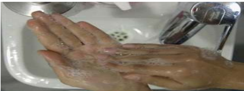
gers on nd. Do