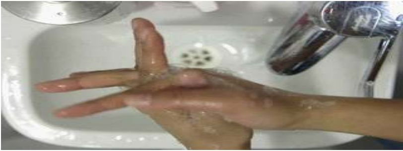
er and gers.